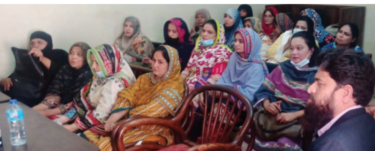
Session on Family Planning Counselling in District Malir, Karachi