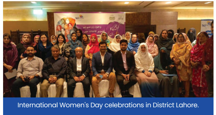
International Women's Day celebrations in District Lahore.