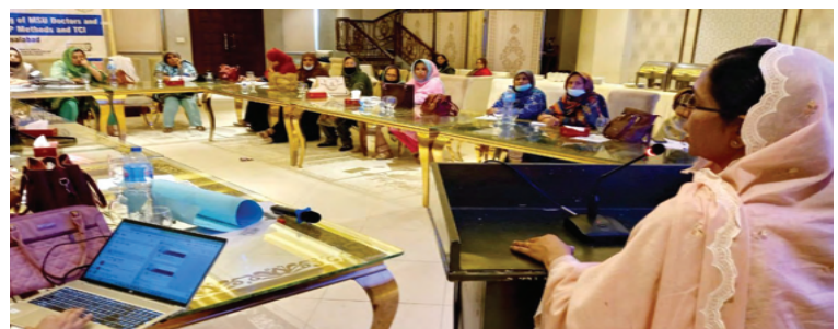
Training of MSU's Doctors and Family Welfare Workers on Family Planning Counselling in District Faisalabad.