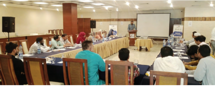
TCI-GSM organized Advocacy session on Family planning for Social media influencers & media persons in District Faisalabad.