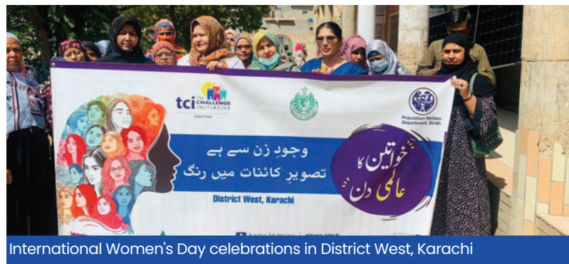
International Women's Day celebrations in District West, Karachi