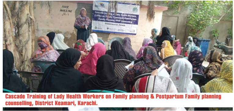
Cascade Training of Lady Health Workers on Family planning & Postpartum Family planning counselling, District Keamari, Karachi.