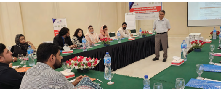
Training of Master Coaches was organized on Family Planning-High Impact Interventions in District Khanewal