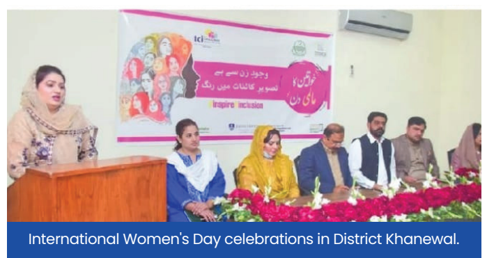
International Women's Day celebrations in District Khanewal.