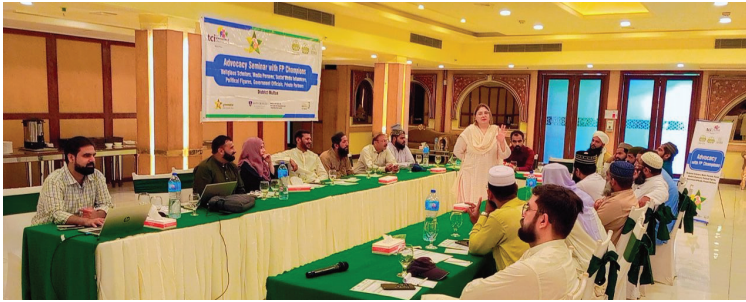
TCI-GSM organized Advocacy session on Family planning for Religious scholars & Media Persons in District Multan.