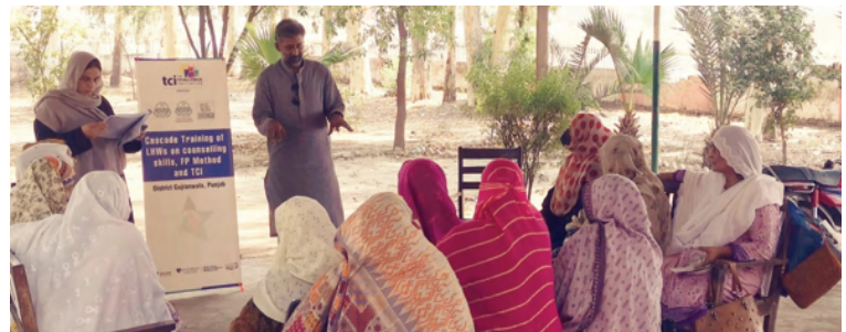
Training was organized for Lady Health Supervisors & Lady Health Workers on Family Planning, Communication and counselling skills in Gujranwala