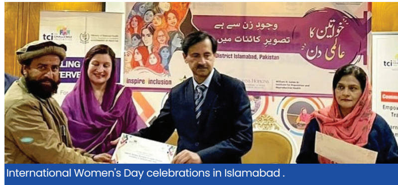
International Women's Day celebrations in Islamabad .

TCI-Greenstar celebrated International Women's Day 2024 across TCI implementing Districts (15) of Punjab, Sindh and Islamabad Capital Territory.