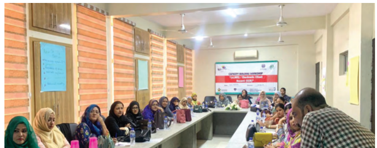
Training of Health Care Workers on Electronic Client Record & cLMIS in Karachi