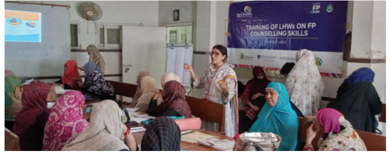
Training of Lady Health Workers on Family Planning Counselling Skills in District West