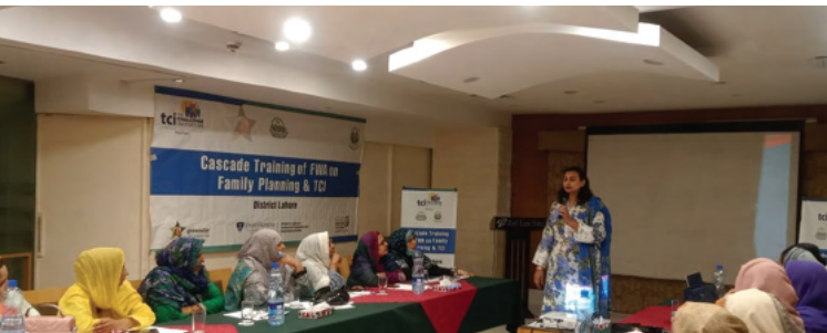
Training of Family Welfare Assistants on Family Planning, Communication & Counselling Skills in Lahore.