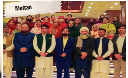
Multan Refresher training of Doctors, Religious Scholars, Family Welfare Workers on advocacy for Family Planning