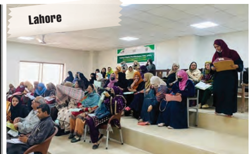
Lahore Training of medical staff, DEOs to enhance the digital literacy and system proficiency of service providers in effectively utilizing the HMIS and MIMS.