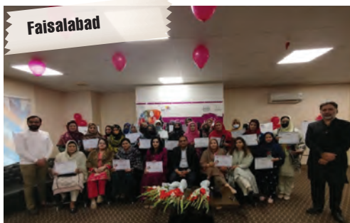
Faisalabad On-the-Job Training for Health Staff at RHC Qazian, Rawalpindi