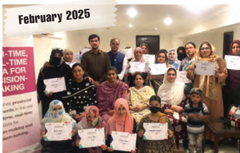
February 2025 Capacity building Workshop for FWAs & Male Mobilizers