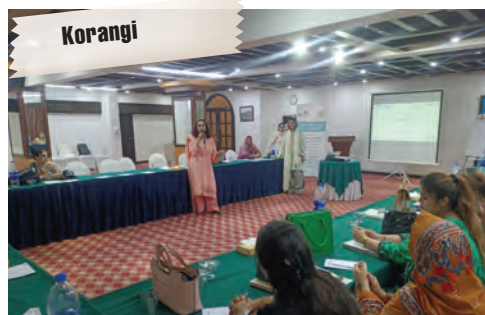
Korangi Refresher training of medical staff on advanced FP methods and counselling skills