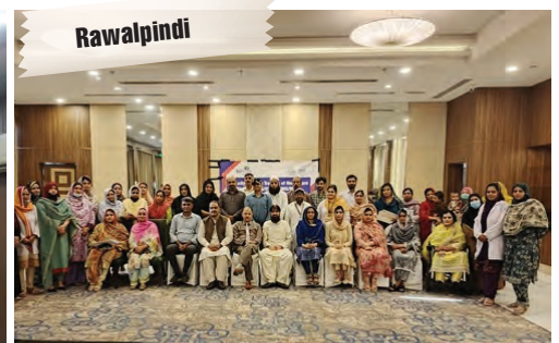
Rawalpindi Training on Data Management for Medical Staff & Computer operators