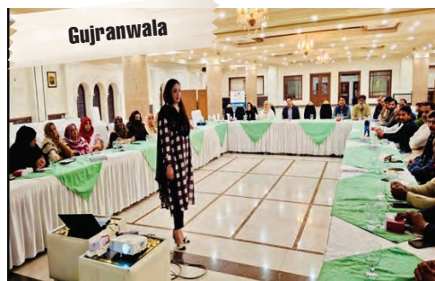
Gujranwala Training to strengthen the technical knowledge and counseling skills of FWWs and FWAs for improved delivery and promotion of FP