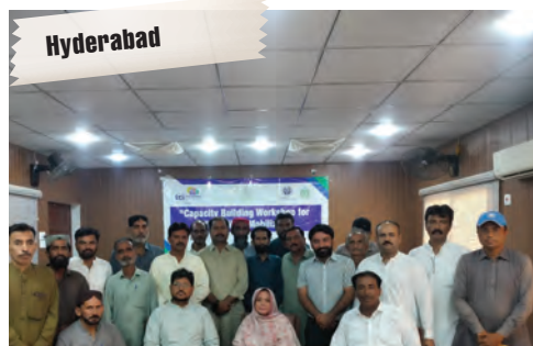
Hyderabad Capacity building Workshop for FWAs & Male Mobilizers