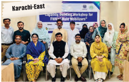
Karachi-East Capacity Building Workshop for FWAs & Male Mobilizers June-2025