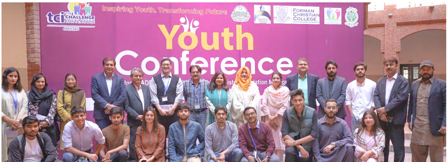
A group photo of high level designatories along with participants at youth conference.

Hundreds of students actively engaged in open discussions on family planning, reproductive health, and breaking social stigma, signaling a powerful shift toward youth-led advocacy.