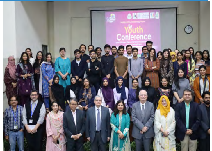
A group photo of high level designatories along with participants at youth conference.

"Youth as Catalysts of Change," "Harnessing the Population Dividend," and "The Significance of Pre-Marital Counseling." Their insights highlighted the pivotal role of young people in shaping a progressive and well-informed society.