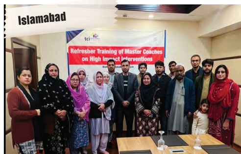
Islamabad Refresher training to update knowledge, facilitation skills, and mentoring competencies of existing Master Coaches involved in capacity-building initiatives.