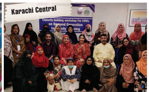
Karachi Central Capacity Building workshop for CHWs on demand generation for Family Planning